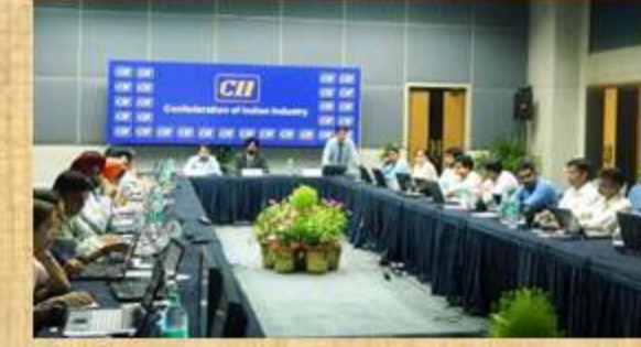
Excel Level 1 & PowerPoint Training at CII, Chandigarh