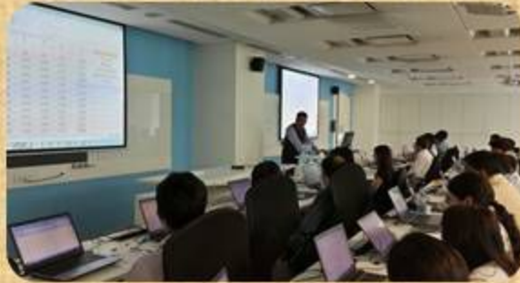
MS Excel Training at Samsung