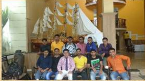
MS Office Excel 1 & 2 Training at Room to Read, Goa