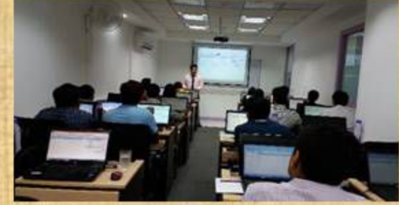
Open House Training on Excel & Macros, Gurgaon