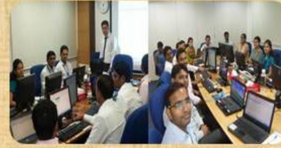
MS Office Training at Olympus Medical Systems