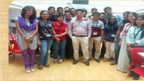
MS Office Training at Siemens