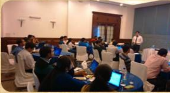
MS Excel Training at Hero Motorcorp