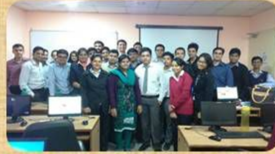
MS Office Excel Training at Accenture, Gurgaon