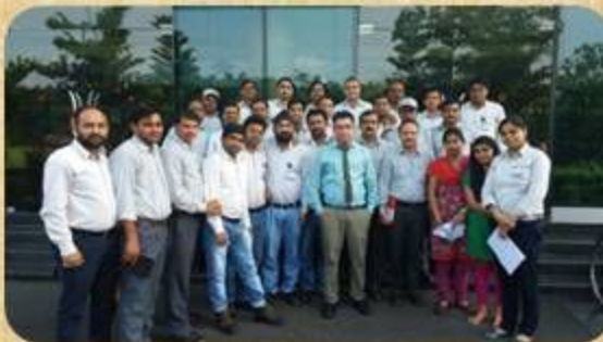
MS Office Training at Asahi Glass India