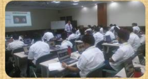
MS Excel & Powerpoint training at Honda Cars