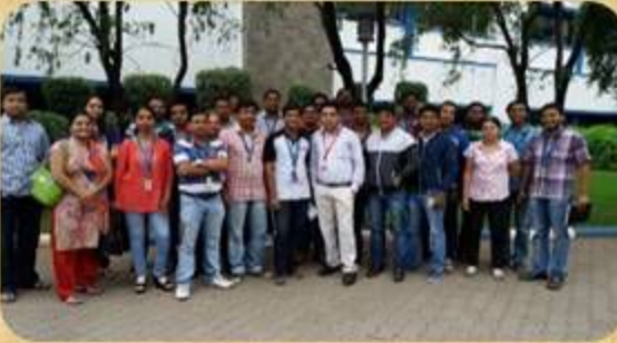
MS Excel, Macros & Access Training at Steria Pune