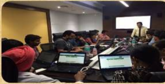
MS Excel Level 1 & 2 Training at Magicbricks