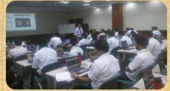
MS Excel & Powerpoint training at Honda Cars