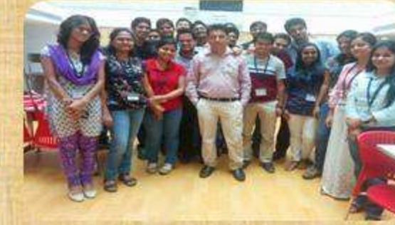
MS Office Training at Siemens