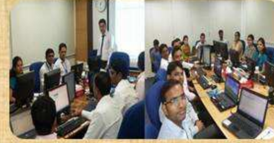
MS Office Training at Olympus Medical Systems