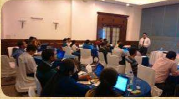
MS Excel Training at Hero Motorcorp