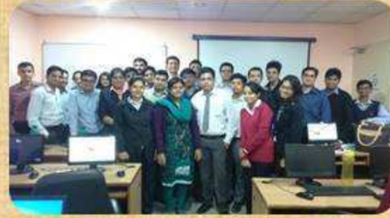
MS Office Excel Training at Accenture, Gurgaon