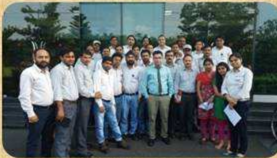
MS Office Training at Asahi Glass India