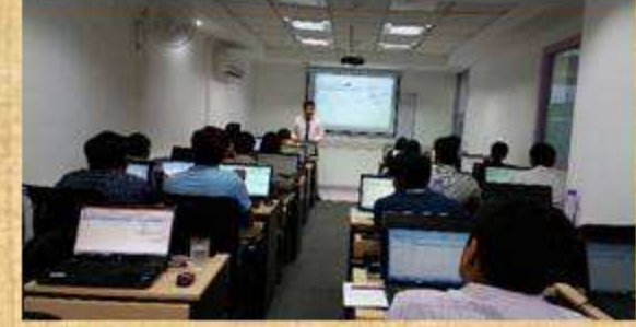
Open House Training on Excel & Macros, Gurgaon