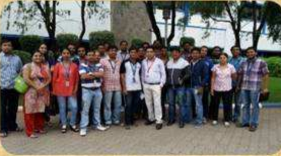
MS Excel, Macros & Access Training at Steria Pune