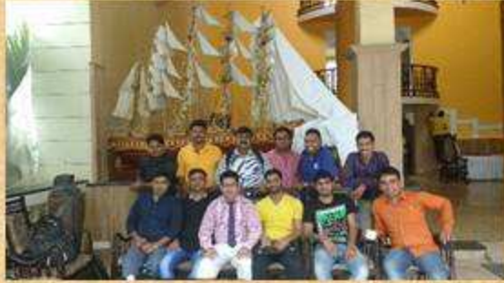
MS Office Excel 1 & 2 Training at Room to Read, Goa