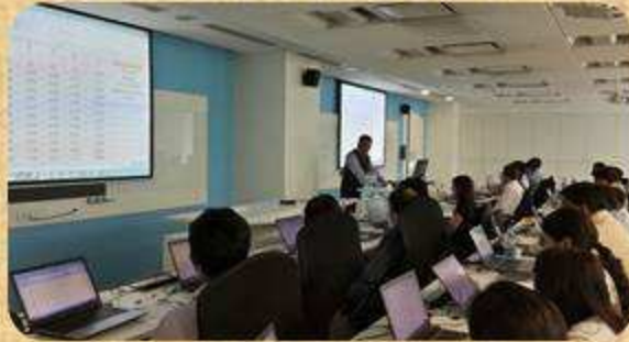
MS Excel Training at Samsung