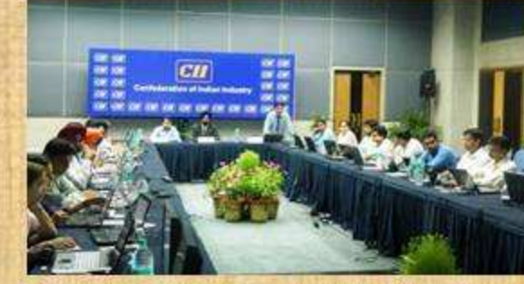
Excel Level 1 & PowerPoint Training at CII, Chandigarh