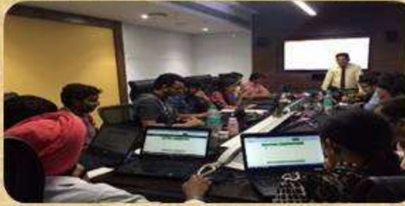
MS Excel Level 1 & 2 Training at Magicbricks